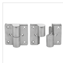
self-closing hinges (stainless steel)