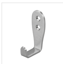
hook (stainless steel)