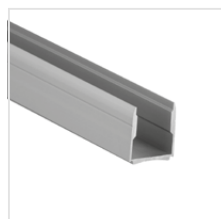
U profile for attaching panels to the wall (anodized aluminium)