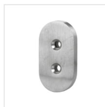
door stop (stainless steel)