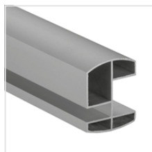
top profile (anodized aluminum)