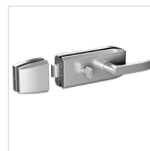
handle with lock (stainless steel)